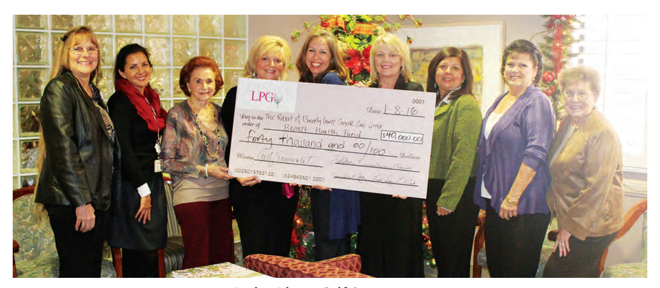
Ladies Plastic Golf Organization

again, we also ended the year with our annual holiday open house where we celebrate the holidays with over 150 of our current and past patients.