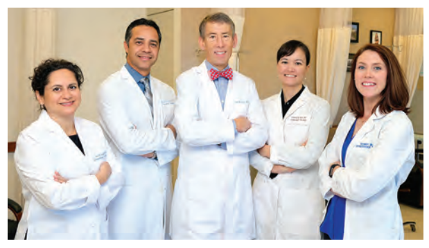
Gynecologic Oncology Associates

Our GYN Oncology services continue to expand since Gynecologic Oncology Associates (GOA), a group of five board certified gynecologic oncologists, joined our medical staff in 2011. GOA continues to be a valuable asset to our community providing GYN oncology expertise to our patients. PVHMC can now serve women with gynecologic cancers right here. Our patients receive the most up to date in gynecologic cancer treatments. This includes minimally invasive laparoscopic or robotic surgery, ultra-precise radiation therapy utilizing TomoTherapy and Trilogy, both of