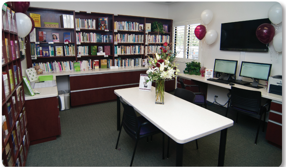
Cancer Care Center's newly renovated library

Family Cancer Care Center provides information about all aspects of cancer (prevention, site-specific cancers, treatments) as well as resources for coping for both patients and their families.