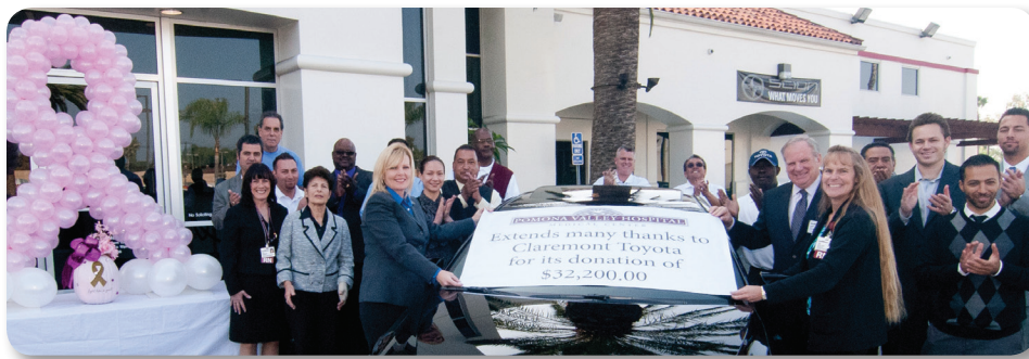
Claremont Toyota Team and PVHMC Associates